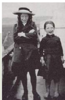
A miscellany of people, places and events presented by The Holt Society