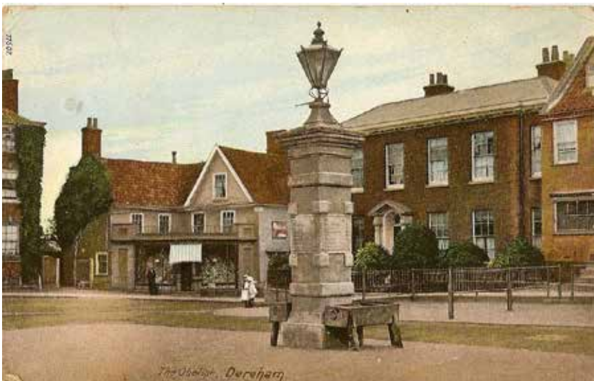
East Dereham.

Each town incises different mileages on the piers, giving accurate distances to numerous towns and properties within Norfolk. Whilst the list of places chosen are closely aligned to each other, the