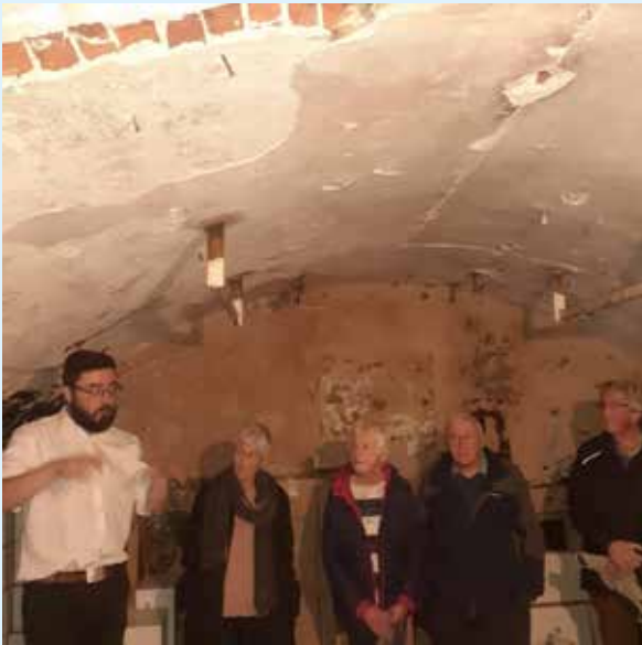
Holt Society visit to Bakers & Larners cellars

To date we have identified 26 cellars and have already surveyed eight – in just a couple of weeks! If you want to become involved, or know of a cellar, do please contact us via the normal email or by telephone on 01263 711223.