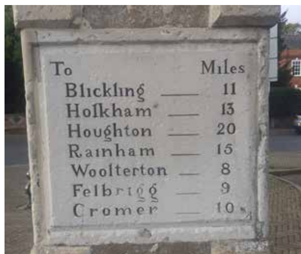
Inscription on Holt Obelisk.