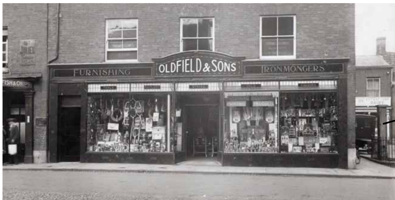
Site of the pump drawing water from the well into which the broken-up Dereham obelisk was tipped.